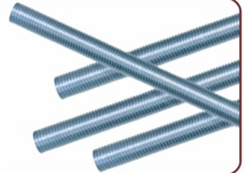
Threaded Rod Zinc Plated