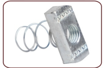
Spring Nut Long