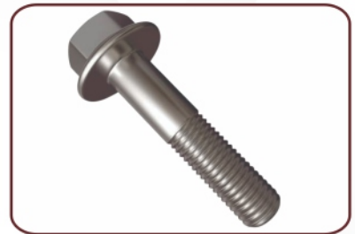
Hex Flange Bolts