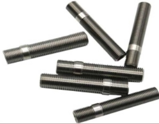
High Tensile Stud Bolts