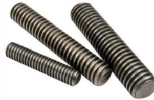
Full Threaded Stud