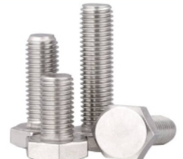
Full Thread Bolts