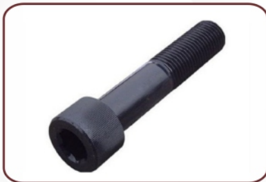
Big Allen Key Bolt