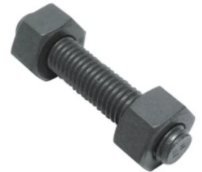
Flange Bolting Stud