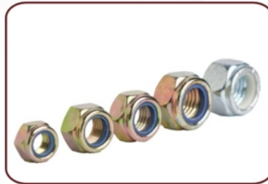
Metric Hex Nut