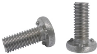
Weld Stud Bolts