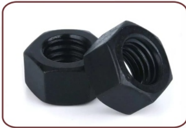
Metric Hex Nut