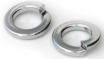
Spring Lock Washer