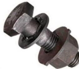
Hsfg Bolt Nut