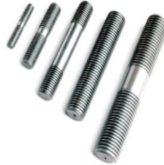
Double End Threaded Stud Bolts